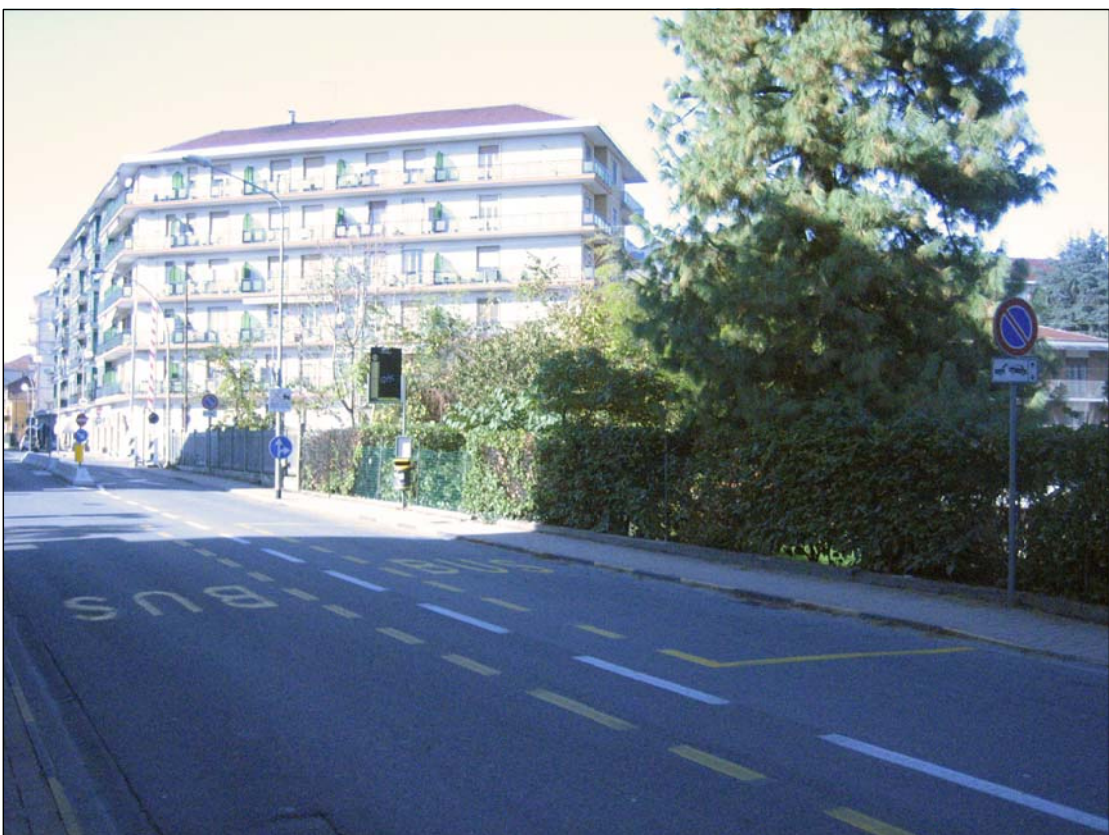
FOTO 01 - FERMATA PETRARCA