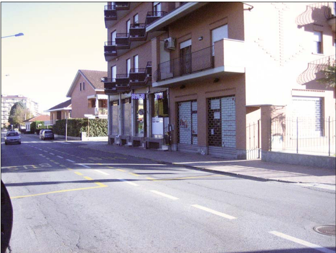
FOTO 02 - FERMATA PARINI